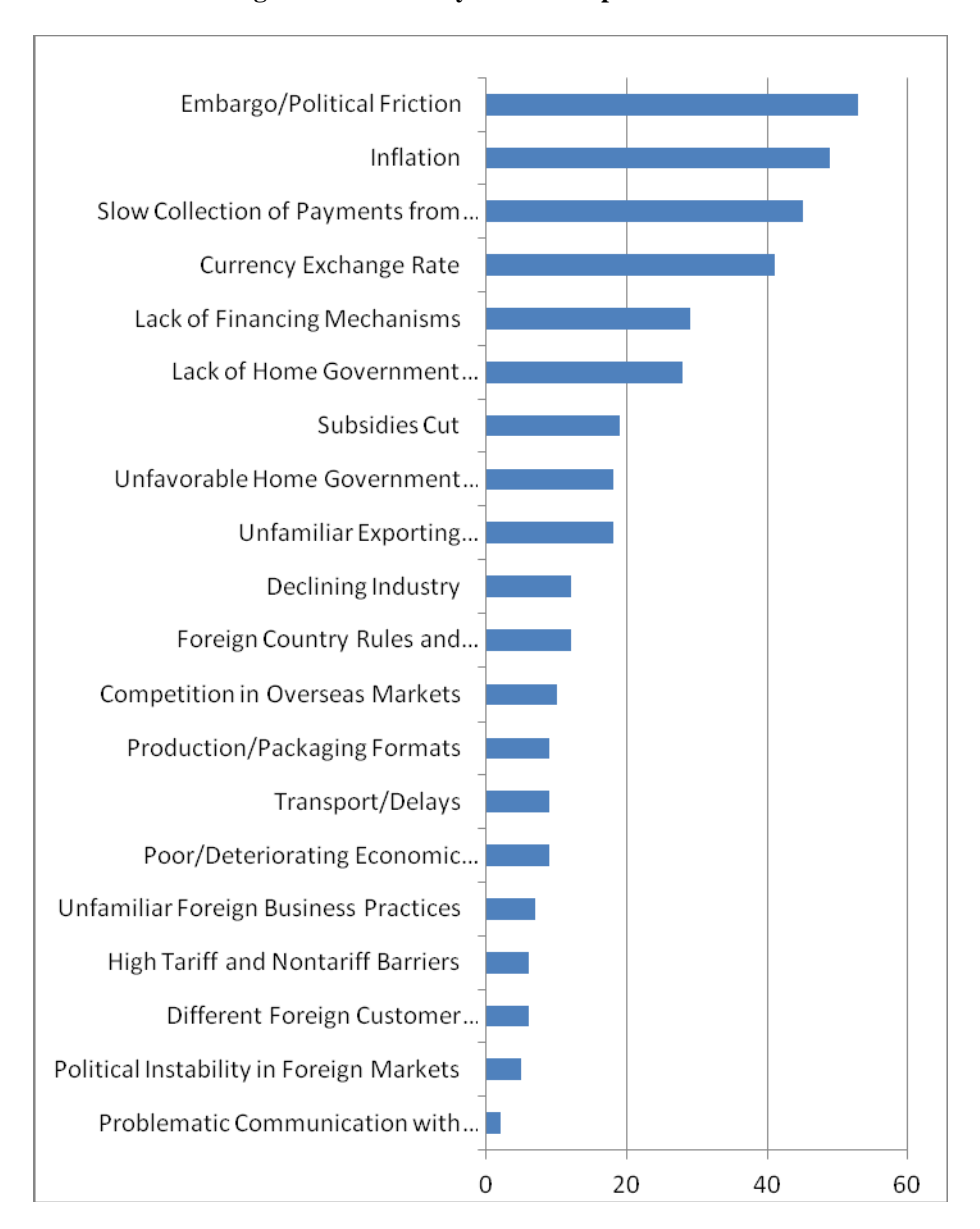
Figure 2: The twenty external export barriers